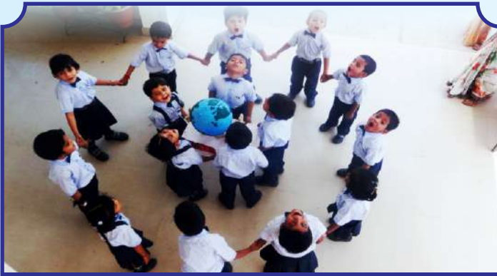
Save Earth Save life