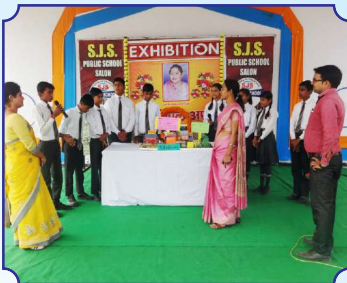
Sharing knowledge by Exhibiting Models