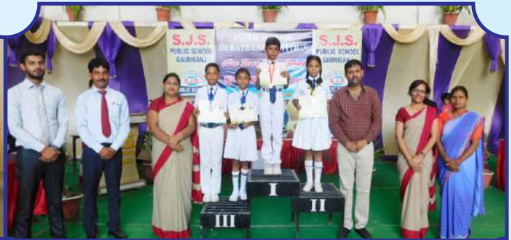
1st PLACE IN DEBATE COMPETITION