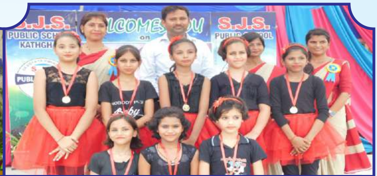
1st PLACE IN WESTERN DANCE COMPETITION