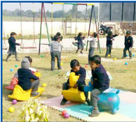
SWING LAWN FOR TINY TOTS