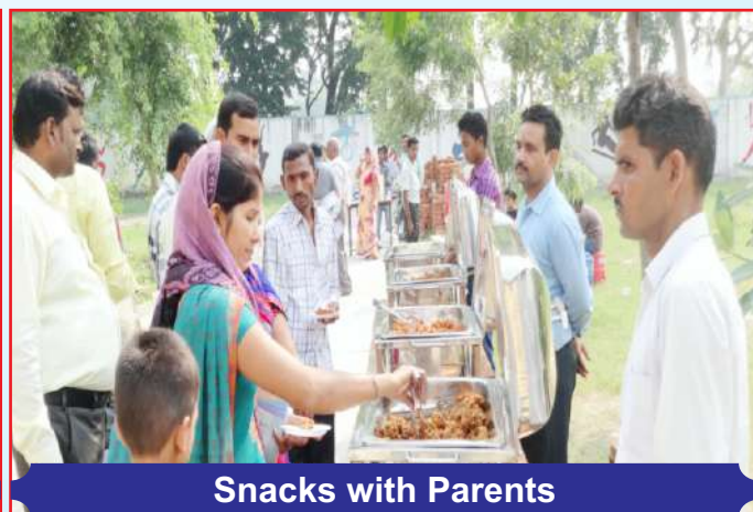
Snacks with Parents