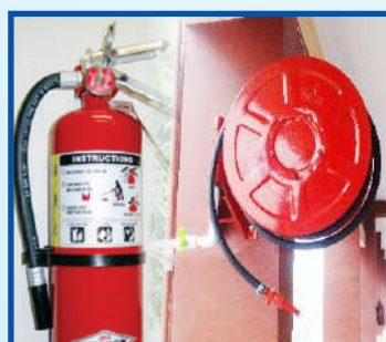
FIRE FIGHTING EQUIPMENTS