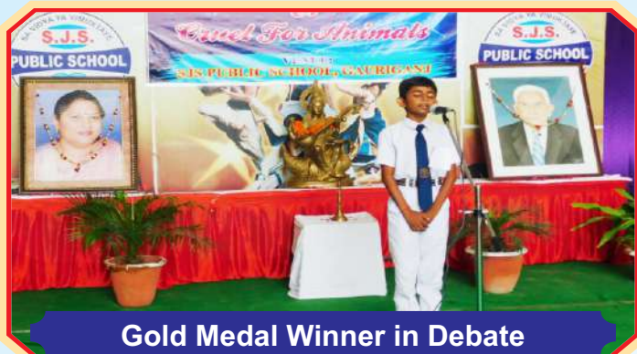
Gold Medal Winner in Debate

Debate, Speech, Drama, Quiz, Song, Dance are the activities not only encouraged by school but given proper training and atmosphere as well as the suitable stage to all interested students for performing their skill inside and outside the school campus. Special programmes are arranged for social awareness.