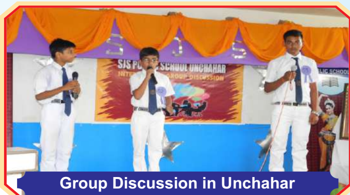
Group Discussion in Unchahar