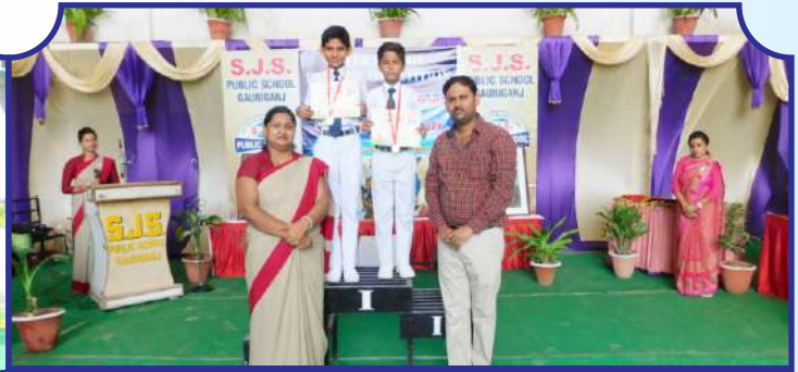
1st PLACE IN SLOGAN WRITING