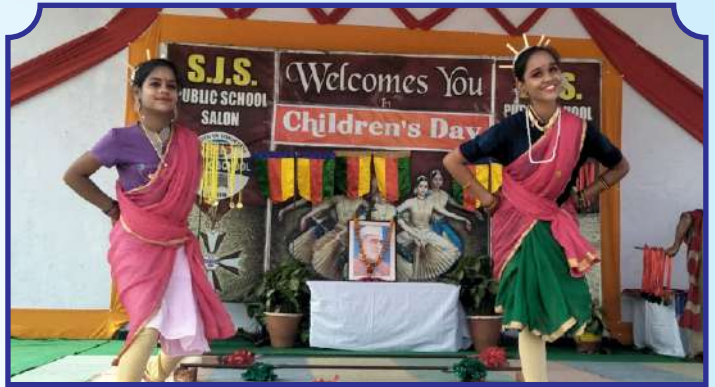
We Are Stage Free