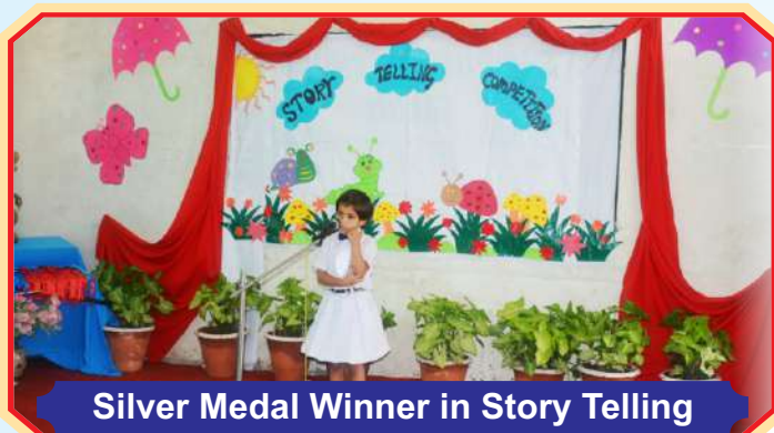
Silver Medal Winner in Story Telling