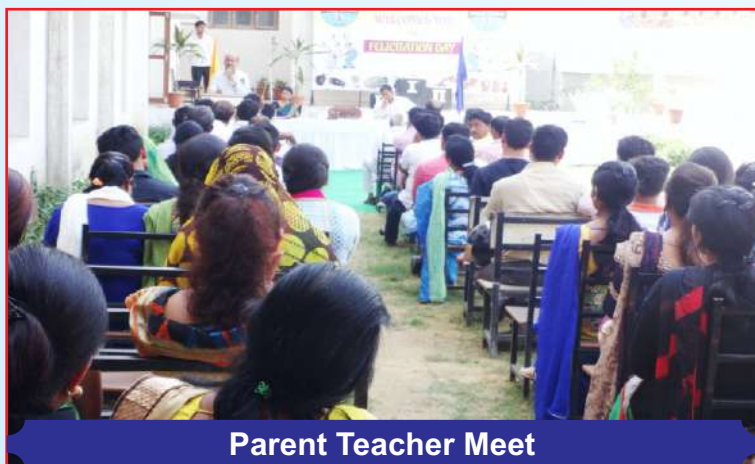
Parent Teacher Meet