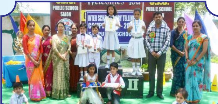
1st PLACE IN STORY TELLING COMPETITION