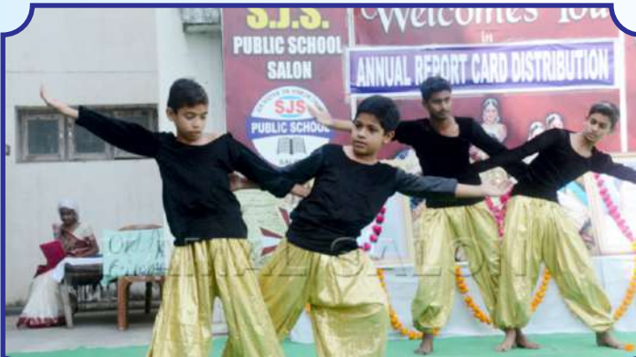
Parents Are Our God