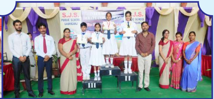
3rd PLACE IN DEBATE COMPETITION