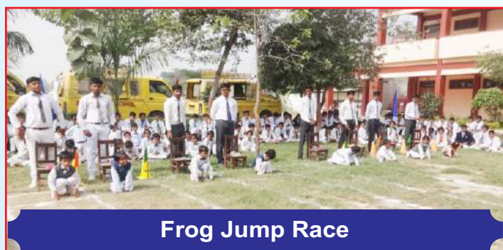
Frog Jump Race

Indoor/outdoor games and sports besides many other activities such as plantation, rallies for social awareness, national festivals are arranged through out the session with an object to develop leadership quality and confidence as well as preserverence of Indian culture.