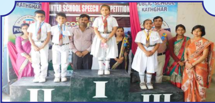
1st PLACE IN SPEECH COMPETITION