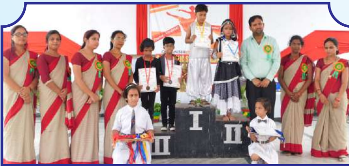
2nd PLACE IN SOLO DANCE COMPETITION