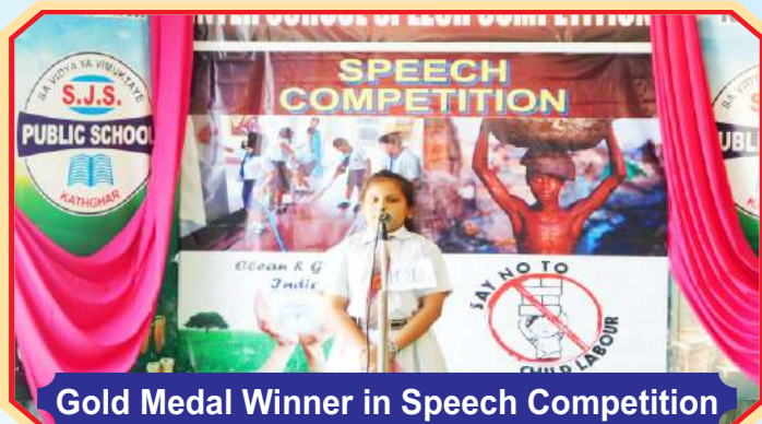
Gold Medal Winner in Speech Competition