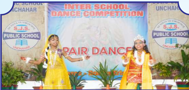
1st PLACE IN PAIR DANCE COMPETITION