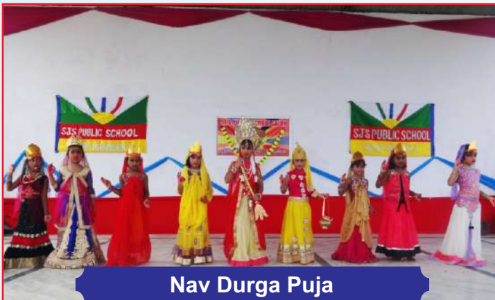
Nav Durga Puja