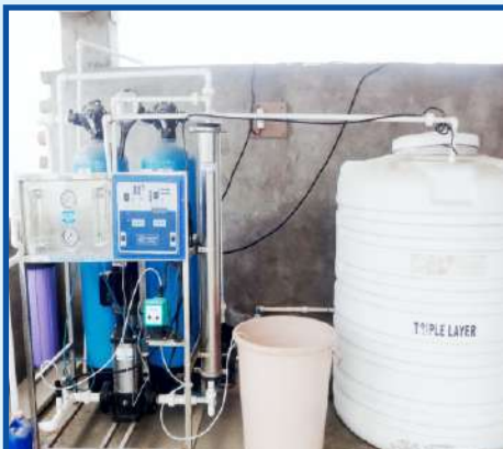
RO & CHILLER